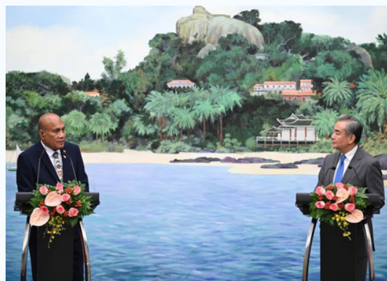
left: H.E. President Taneti Maamau right: Chinese Foreign Minister Wang Yi

3rd China-Pacific Island Countries (PICs) Foreign Ministers' Meeting, held May 28-29, 2025, in Xiamen, Fujian Province, China. Chinese Foreign Minister Wang Yi (a Political Bureau member) co-chaired with Kiribati's President and Foreign Minister Taneti Maamau, hosting foreign ministers from the 11 Pacific Island nations with diplomatic ties to Beijing